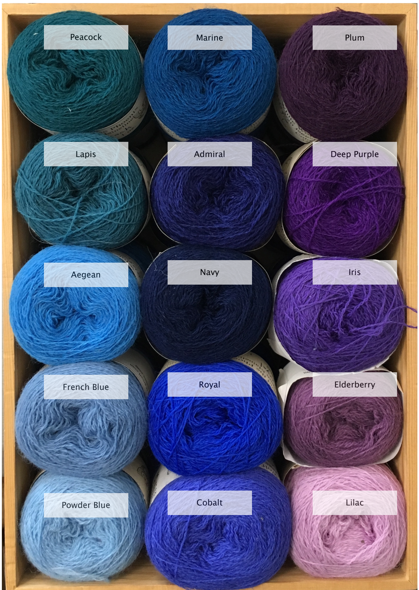
Mainline Wool (2/20 pictured and 2/8) [box 3]