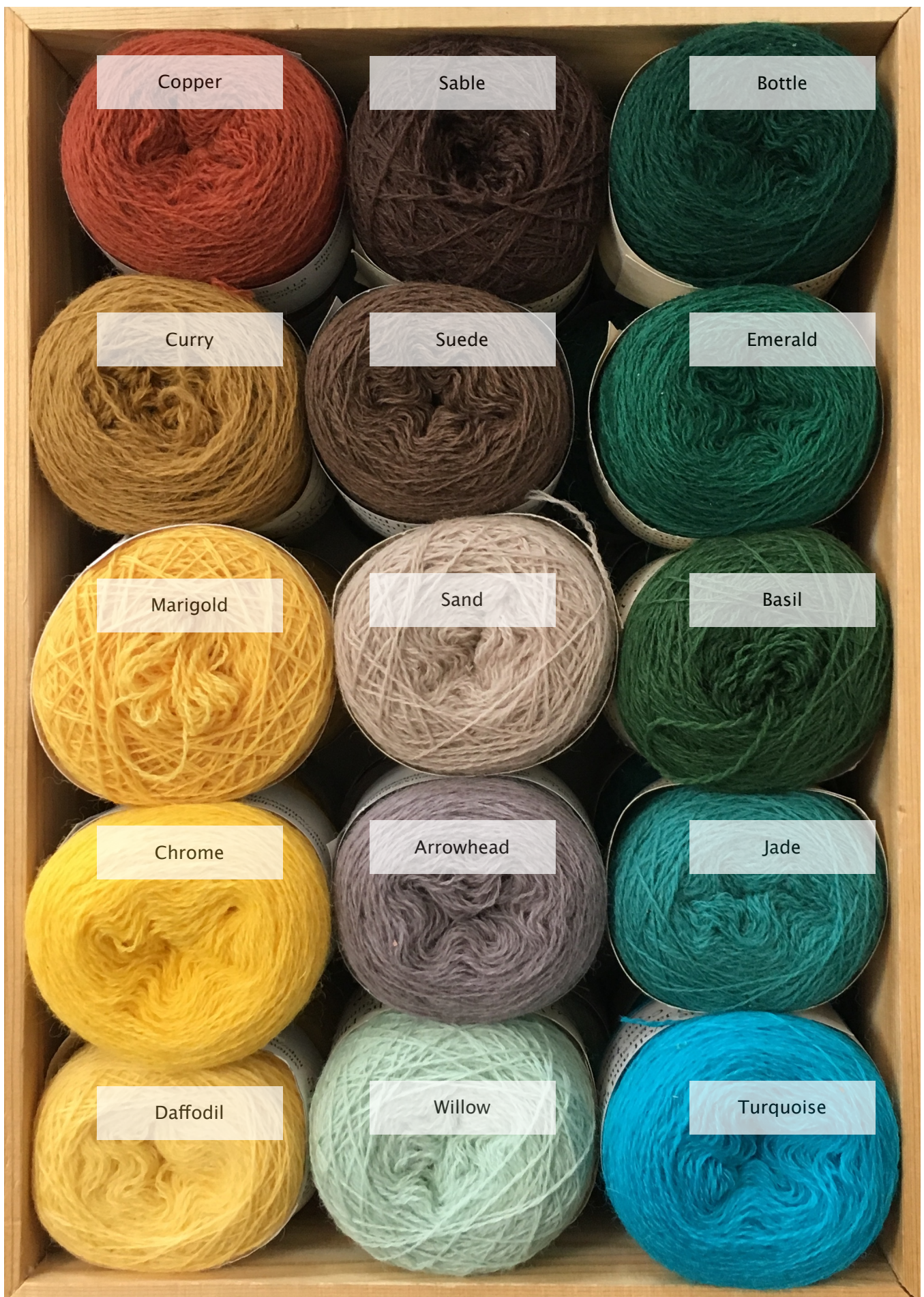
Mainline Wool (2/20 pictured and 2/8) [box 2]