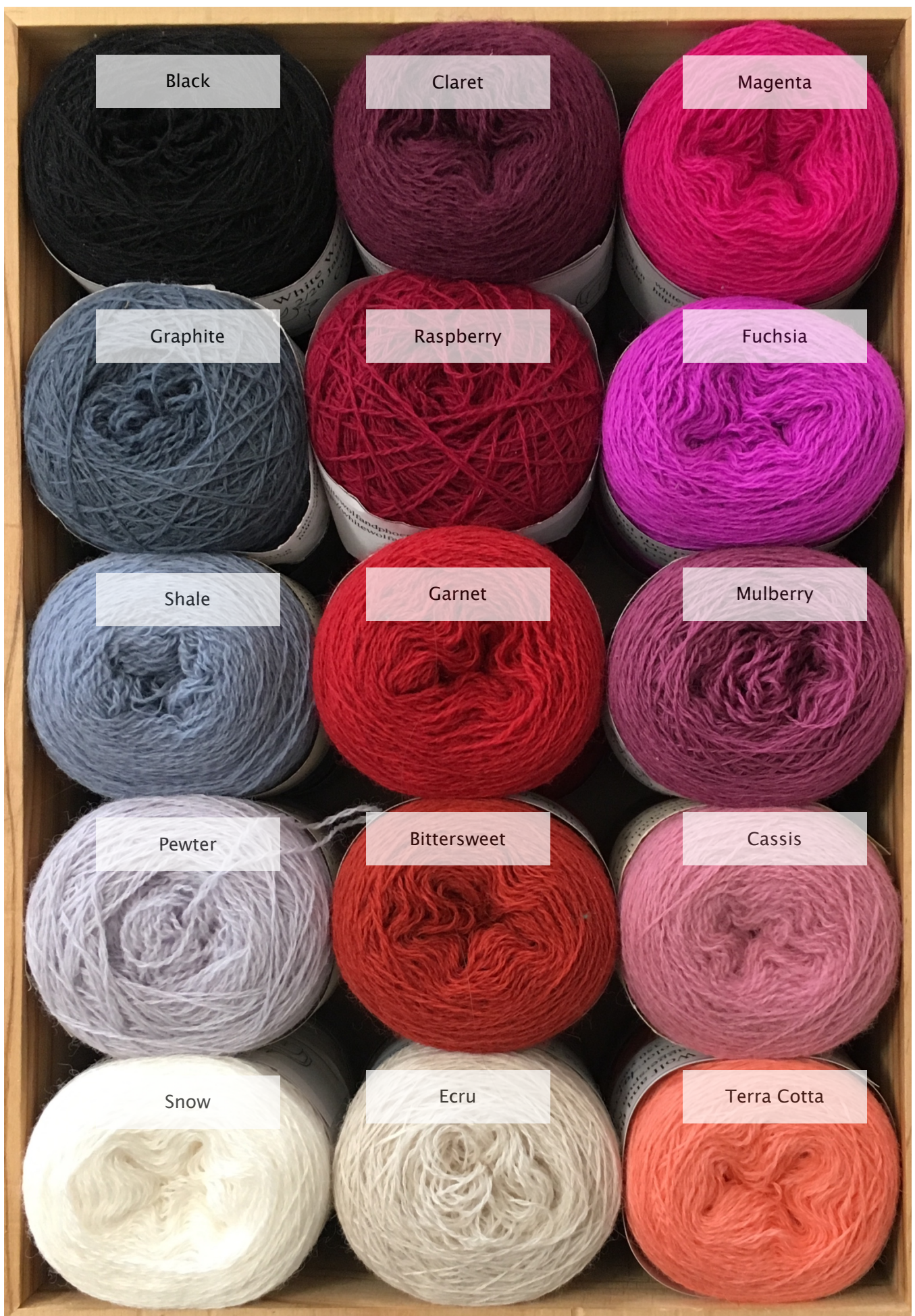
Maineline Wool (2/20 pictured and 2/8) [box 1]